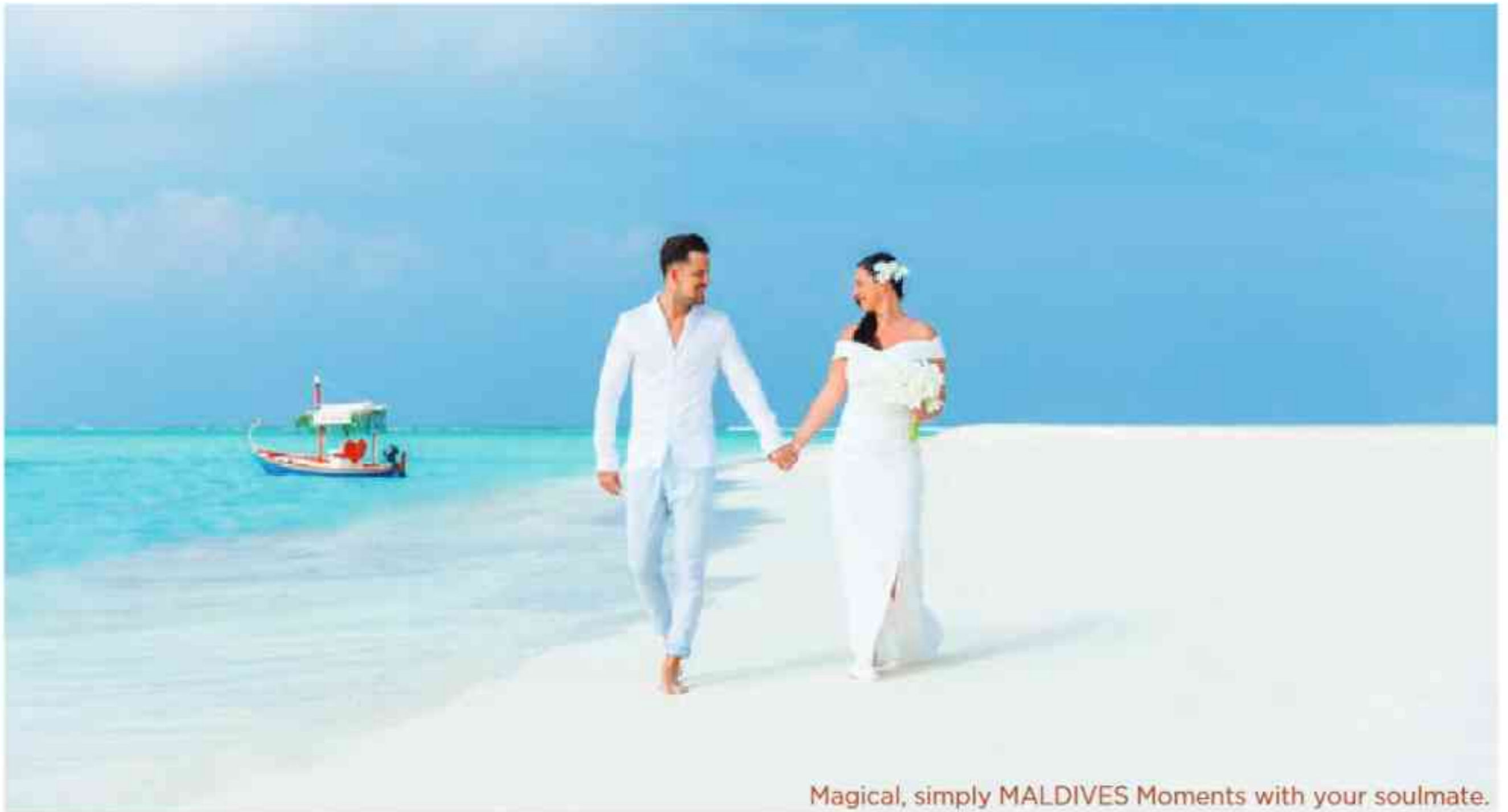
Magical, simply MALDIVES Moments with your soulmate.